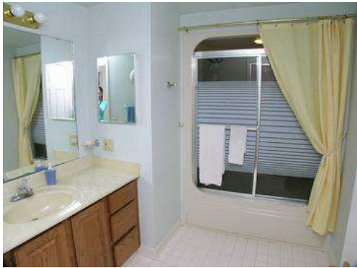
View 26 - Bathroom