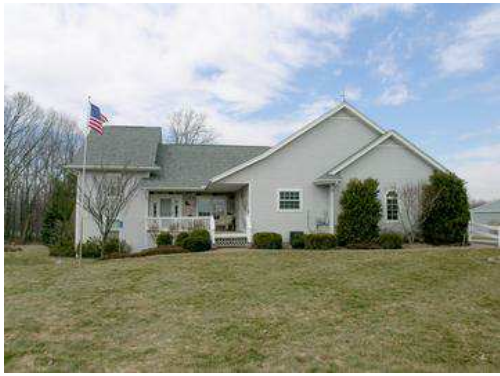
View 1 - Front