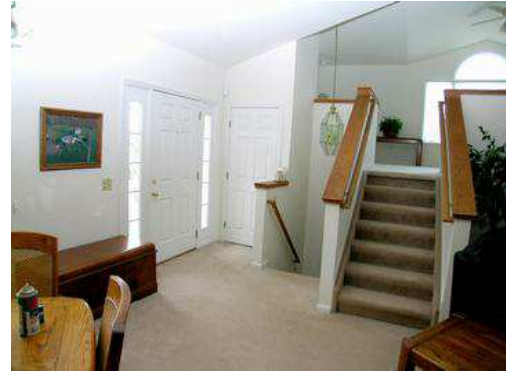
View 9 - Living