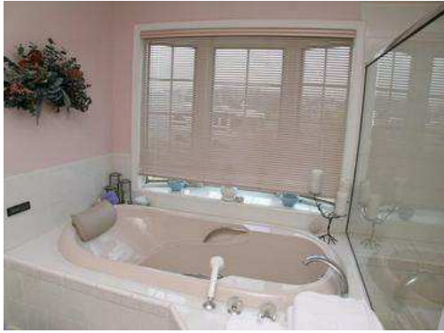
View 19 - Master Bathroom