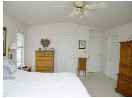
View 18 - Master Bedroom