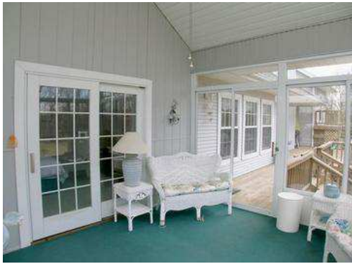
View 22 - Sunroom