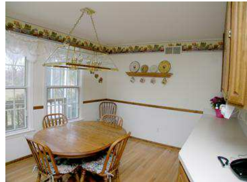
View 15 - Dining