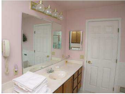
View 20 - Master Bathroom