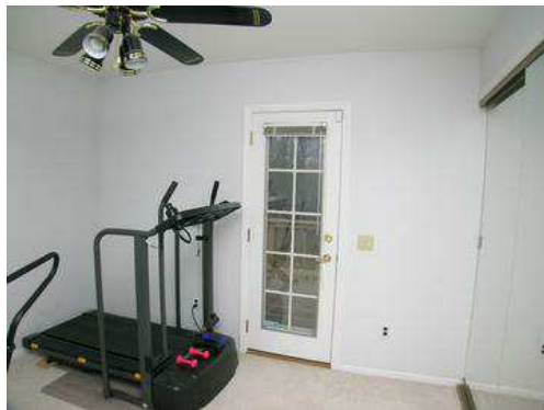
View 30 - Bedroom