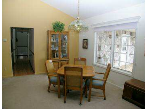
View 11 - Living