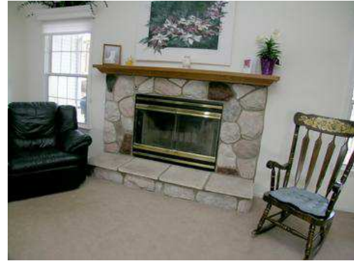
View 12 - Fireplace