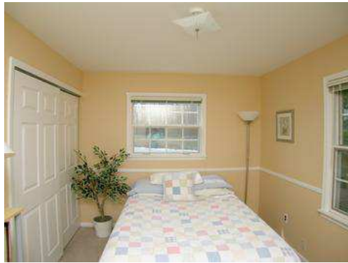
View 27 - Bedroom