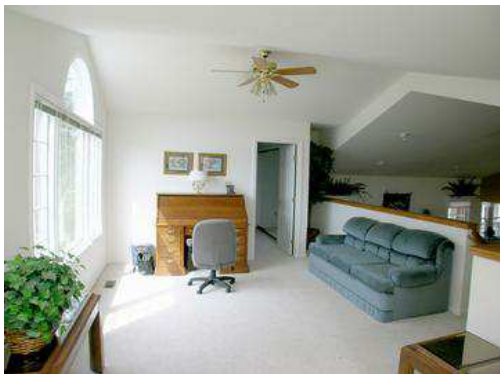
View 29 - Study