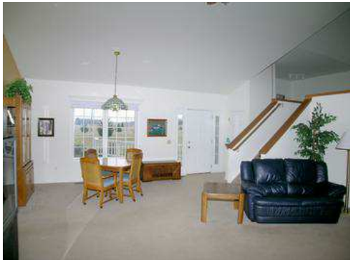
View 13 - Living