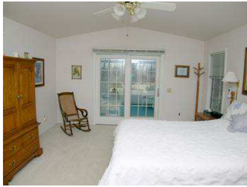
View 17 - Master Bedroom