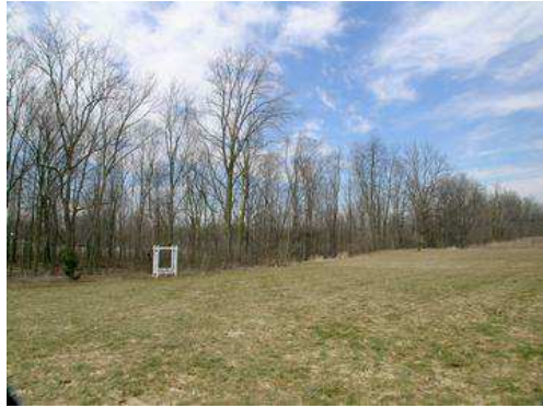
View 8 - Backyard