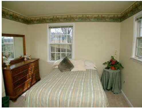
View 24 - Bedroom