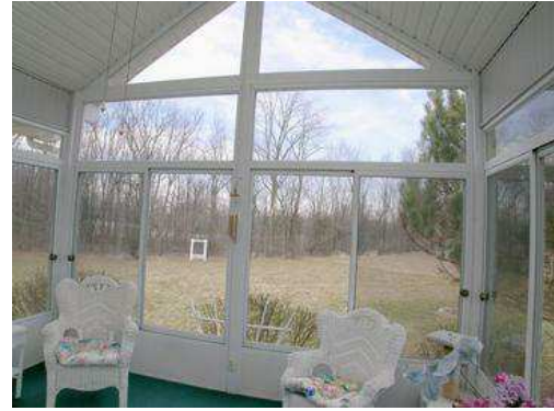
View 21 - Sunroom