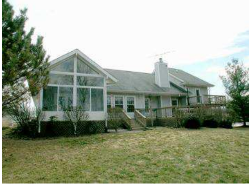
View 4 - Back