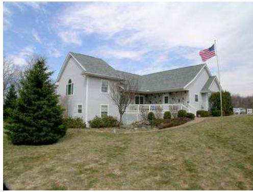
View 2 - Front