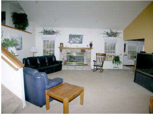
View 10 - Living