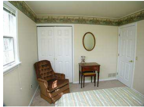
View 25 - Bedroom