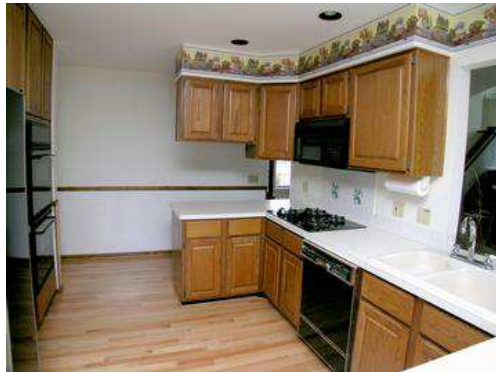
View 14 - Kitchen