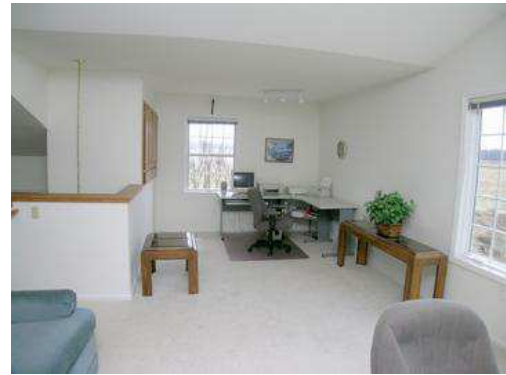
View 28 - Study