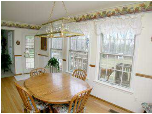
View 16 - Dining