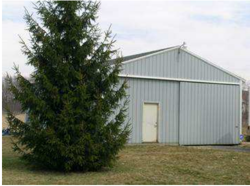
View 7 - Shed