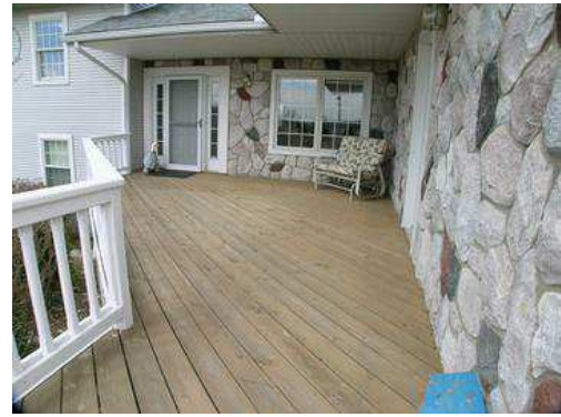
View 3 - Front Porch