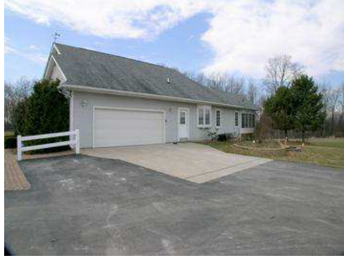
View 5 - Garage