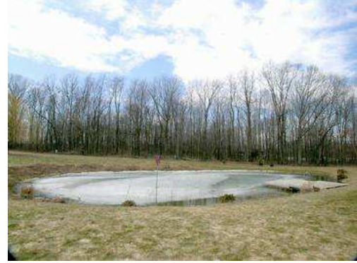
View 6 - Pond