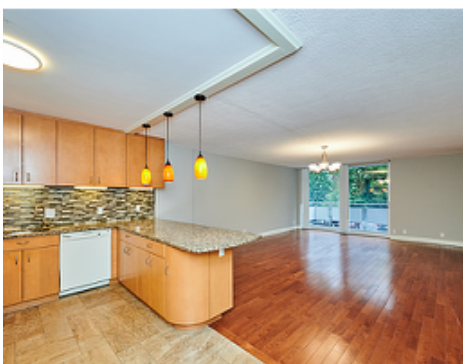
Open Concept Layout