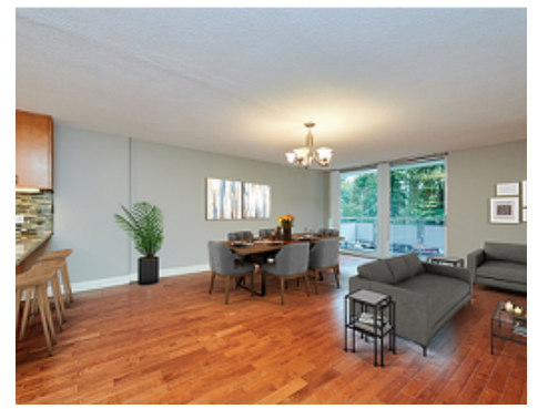
Living Room (virtually staged)