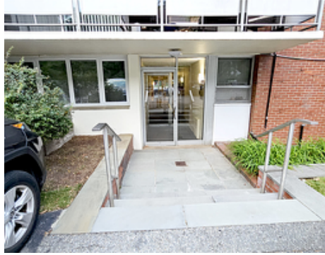
Building – rear entrance from parking lot