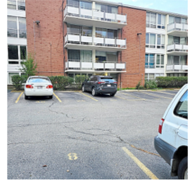
Rear of building from the parking space