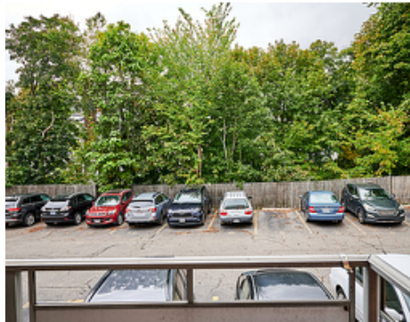
Parking – from balcony