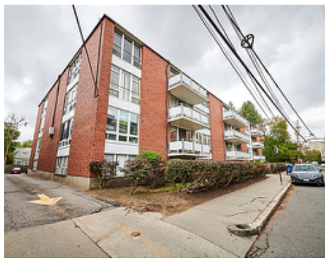
Building – front and exit driveway