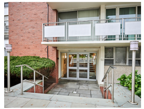
Building – Main Entry