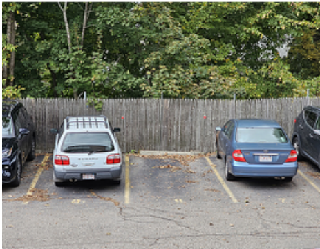
Parking Space (#8) from unit balcony