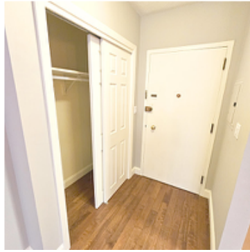
Entry Hall and Closet