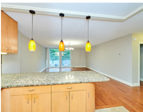
Kitchen – peninsula