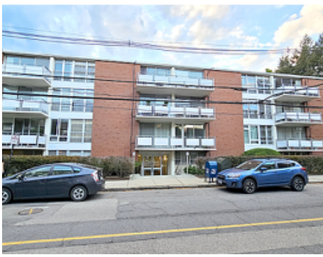
Building – Front