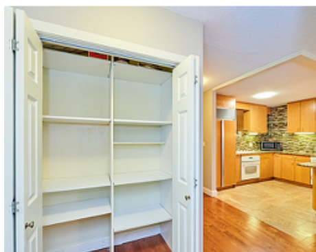
Hall Closet (outside bathroom)