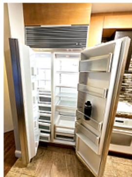
Sub-Zero fridge and freezer