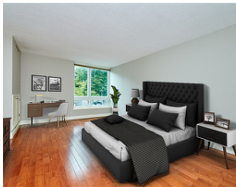
Bedroom (virtually staged)