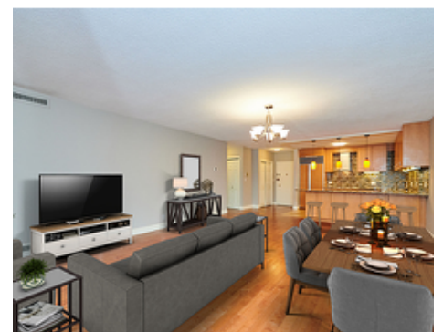
Living Room (virtually staged)