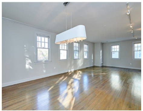
Living Dining Room