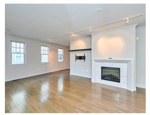
Living Dining Room