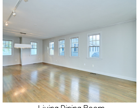
Living Dining Room