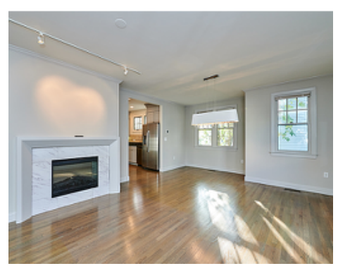
Living Dining Room