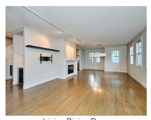
Living Dining Room