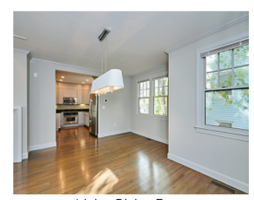
Living Dining Room