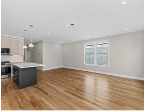
Living Dining Room