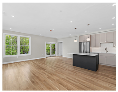
Living Dining Room