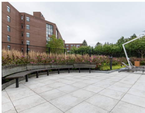
Patio by the Pool