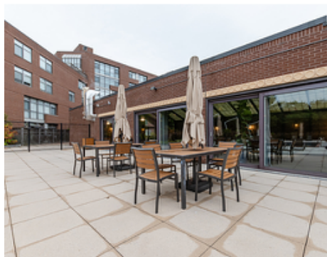
Patio by the Pool