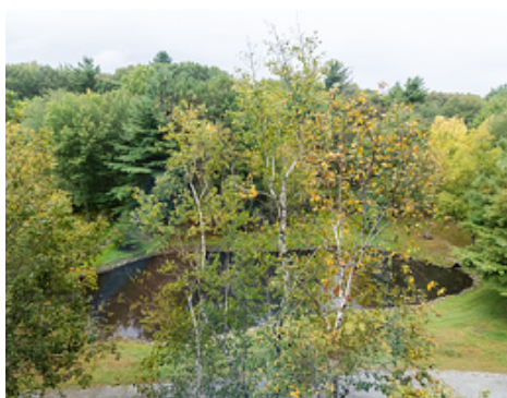
View from the Bedrooms